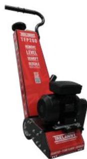
TVS TFP200T 200mm deck scaler Use with KV30 vacuum