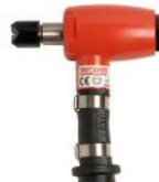
SF1 heavy duty scaler - single head