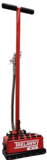
SF11 pneumatic deck hammer