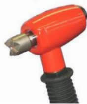
SF1 heavy duty scaler - single head