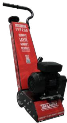
TFP200T 200mm deck scaler Use with KV30 vacuum