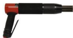
VL303 or VL203 needle scaler