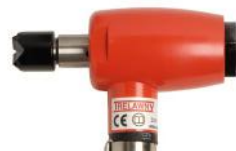
SF1 heavy duty scaler - single head