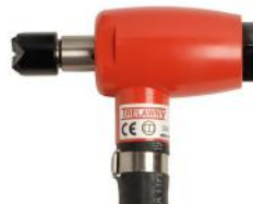
SF1 heavy duty scaler - single head