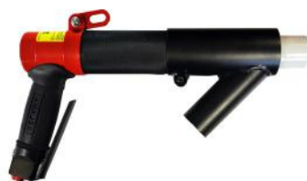
VL303 or VL203 ATEX needle scaler