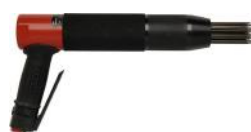
VL303 or VL203 needle scaler